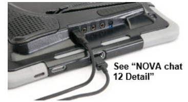
NOVA chat 12