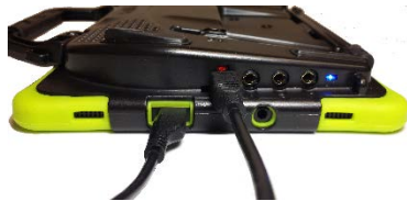
NOVA chat 8