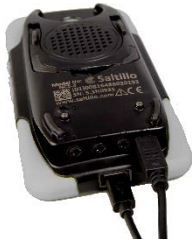
NOVA chat 5

You received a battery charger with your NOVA chat device. Plug the charger’s connectors into the NOVA chat device and amplifier. Plug the other end of the charger into a wall outlet.