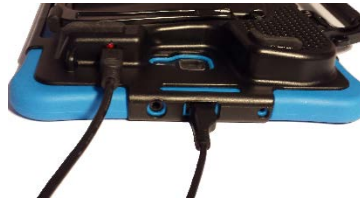
NOVA chat 10